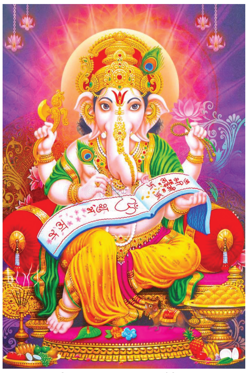
Lord Ganesha, The Remover of Obstacles